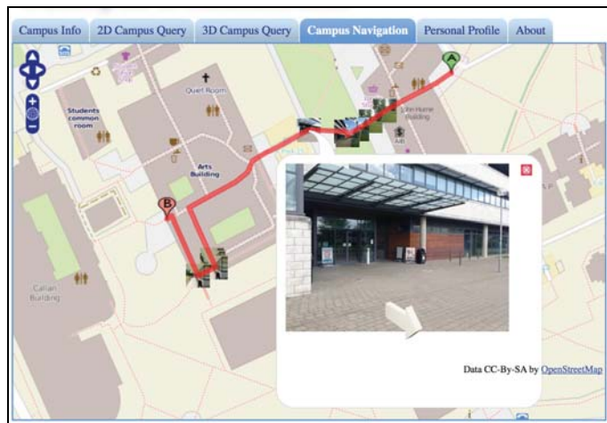
Figure 1. Visual navigational instructions in eCampus web application

In order to study the impact of providing image-based navigational instructions on the movement of the users patterns and/or quality of movement, a survey is conducted and also an experiment is done.