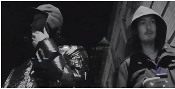
Figure 3: A collaborative performance, playing out in a City location