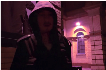
Figure 4: A music video featuring a popular location, uploaded to social media