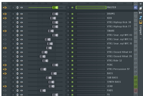
Figure 5 - Configuring levels on the mixer to explore the sound

Figure 5 offers a view of tweaking levels in the mixer. This shows the volume of each sound and how they are connected and chained across channels.