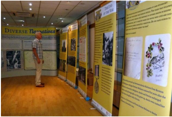
'Diverse Narratives' touring exhibition.

Tata were a major employer of Belgians in the region during the First World War, and are funding two gravestones which will be consecrated in November. The ceremony is expected to be attended by representatives of the Belgium Embassy and other local MPs and dignitaries. The stories of Belgium refugees have also been integrated into a 'Diverse Narratives' touring exhibition, which has appeared in Cheshire public spaces such as market squares and shopping centres. Over 600 people have seen the exhibition and demonstrating the contemporary