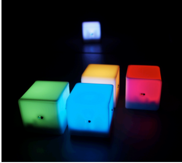
Fig. 3. AudioCubes allow tangible explorations of sound.

Stereo configuration, a recording technique that enables a very 'wide' or dimensional acoustic space. Rather than using a standard sound mixing console to simply turn volumes up and down, the AudioCubes provides a slightly mysterious, but at the same time intuitively tactile and explorative interface to audience engagement with soundscapes.