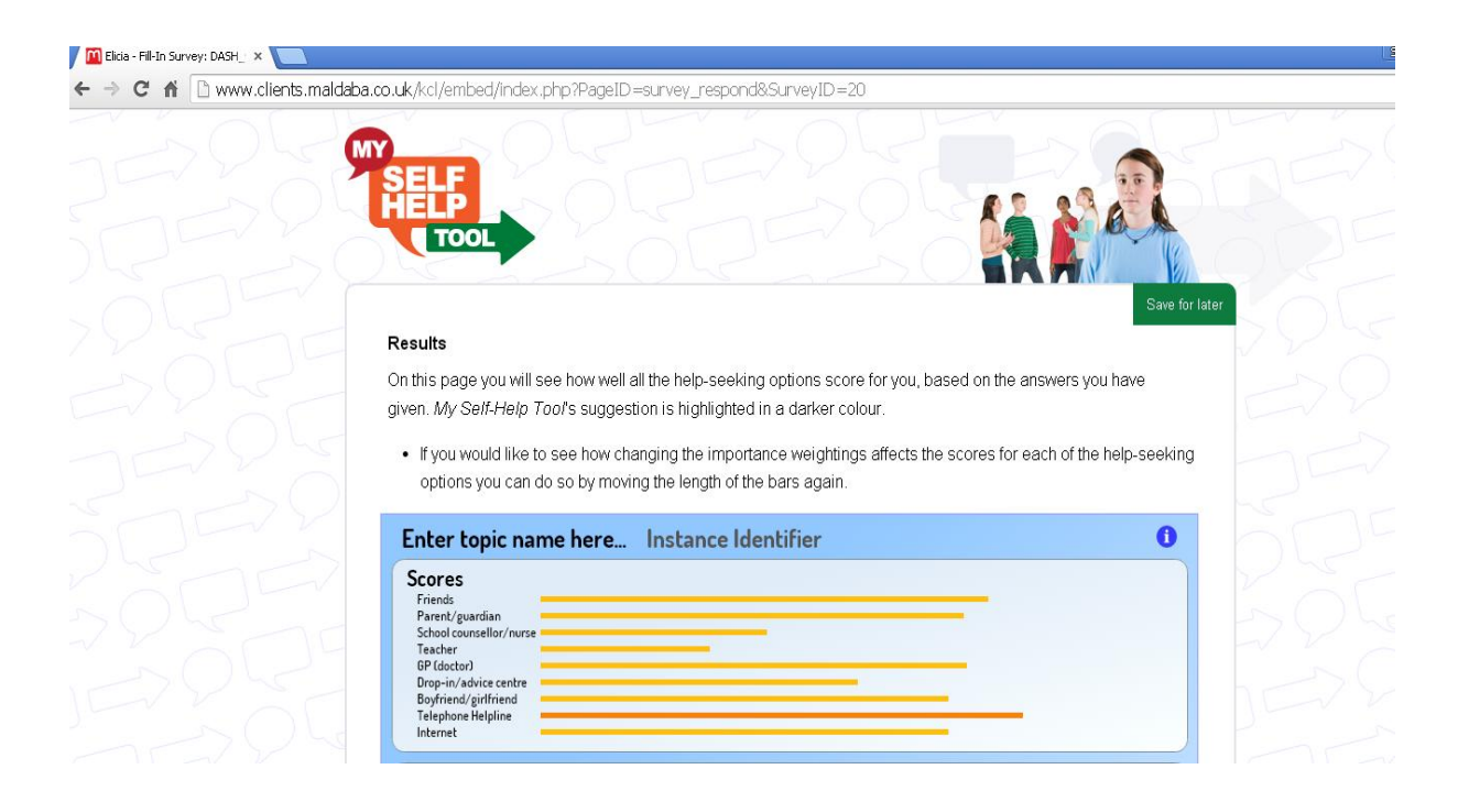
Figure 3: Suggested help-seeking option