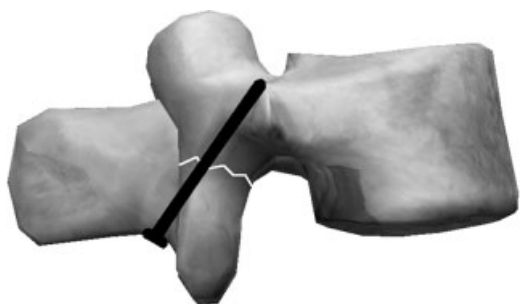
Fig. 5 Buck procedure.

fill the pars defect followed by screws inserted into the superior articular processes bilaterally. These screws are altered such that they accommodate a hook, which hangs over the lamina, which is later secured by a lock nut. This apparatus is fixed to adequately reduce the defect. 21