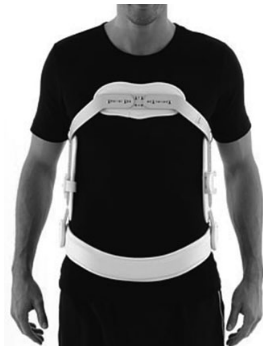
Fig. 4 Jewett brace.

Adaptations to this technique have been made for patients with low bone density or dysplastic lamina. Morscher et al described using hook screw fixation to correct spondylolysis defects 19 ; however, this technique has been described as technically difficult. 20 The technique involves bone grafts to