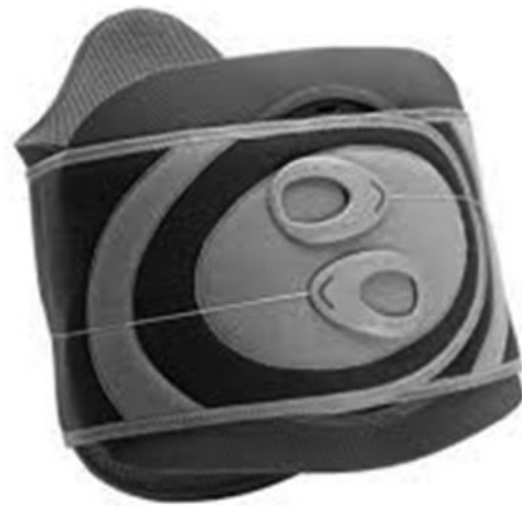
Fig. 3 Lumbo-sacral orthosis brace. (Reproduced with permission, from Ossur UK Ltd.)