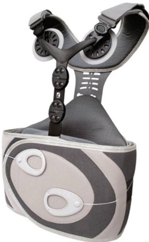
Fig. 2 Thoracolumbosacral orthosis brace. (Reproduced with permission, from Ossur UK Ltd.)

LSOs are often prescribed for treatment after arthrodesis for degenerative conditions. Several studies demonstrated little or no immobilizing effect from wearing LSOs and possibly an increase in L4–L5, L5–S1 motion after application of these orthoses. 13,17