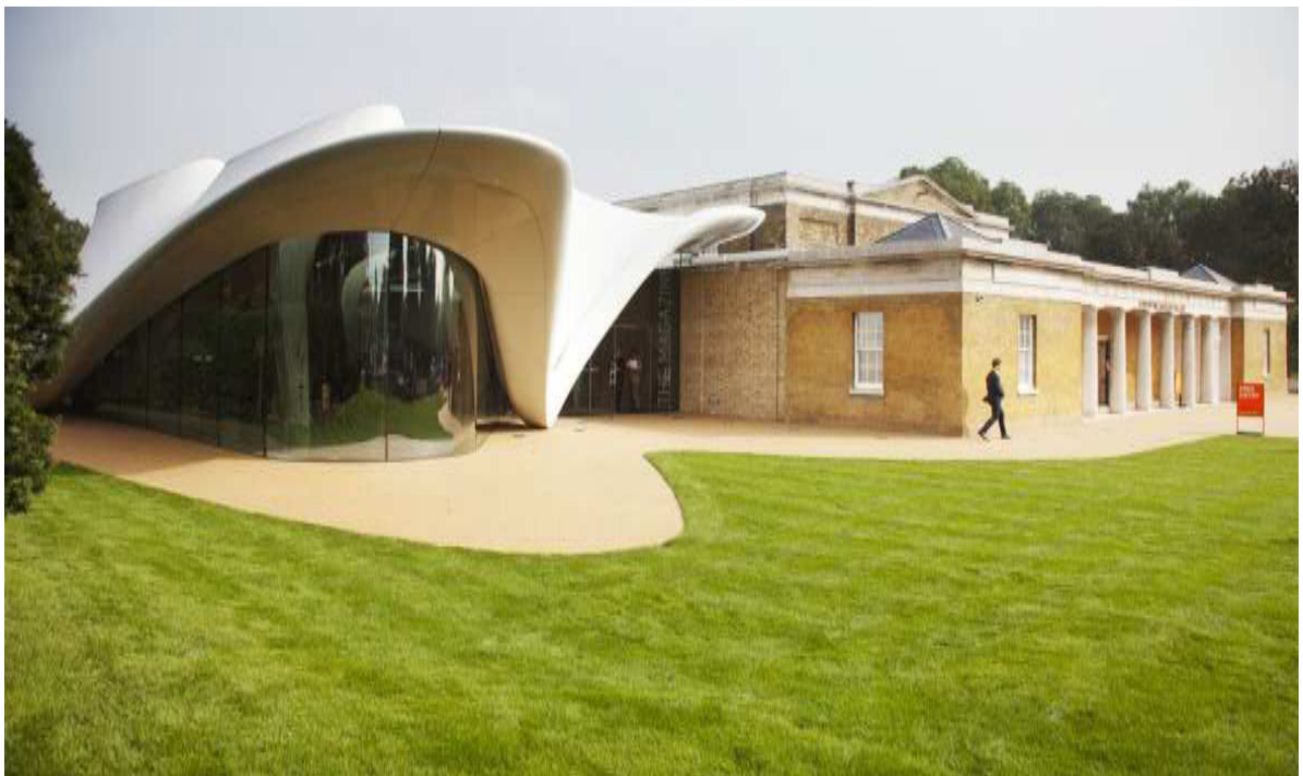
Fig. 3. Serpentine Sackler Gallery presented by Patrik Schumacher, Zaha Hadid Architects, London.