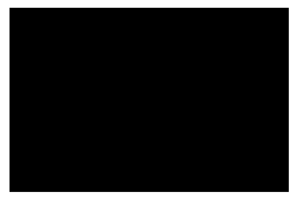
FIG. 37.1 Jamie Vartan, model set design, Misterman by Enda Walsh (18 April 2012, Lyttleton Theatre).

Courtesy \ of the set \ and \ costume \ designer \ Jamie \ Vartan.