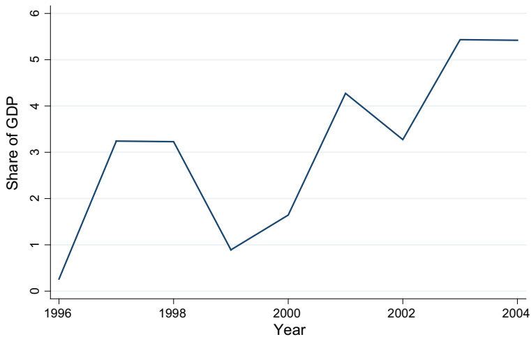
Fig. 2 FDI inflows as percentage of GDP (1996–2004), Source: World Development Indicators (WDI)—2013

There was a drop in these inflows between 1998 and 2000 as a result of the Eritrean–Ethiopian war, but they increased rapidly after the end of the conflict and peaked in 2003–2004 at around $550million. 7 Of the FDI projects licensed by 2003, 46.6 % were in manufacturing and processing; 40.7 % in trade, hotels and tourism; and 12.7 % in agriculture and mining (UNCTAD 2004).