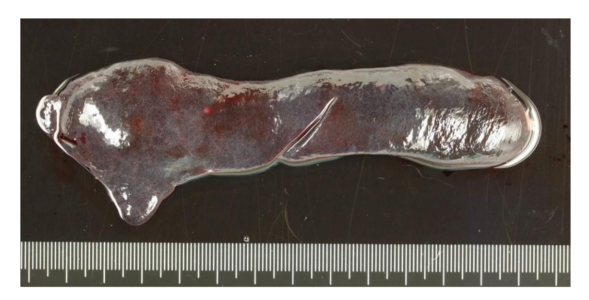
Figure 1. Photograph of the severely and diffusely congested spleen. The ruler indicates millimetre (mm).