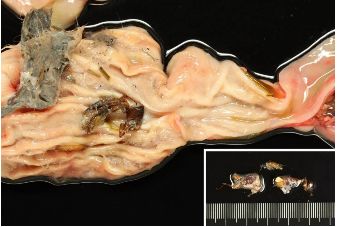
Figure 2. Photograph of the opened stomach with presence of a furball and fragments of cockshafers. Insert: Closer view of the isolated cockshafer fragments. The ruler indicates millimeter (mm).