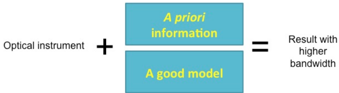
Figure 2 The “information-rich metrology” philosophy

As discussed above, AM provides freedom of design that is generally infeasible with other manufacturing methods, particularly regarding the creation of complex internal features that are inaccessible to well-established measurement tools. X-ray computed tomography (XCT) is currently the best method of measurement for these internal features due to the volumetric nature of the XCT process. XCT is, however, not yet as firmly established as a measurement tool compared to other methods of dimensional metrology, and so research regarding various aspects of the technology is still required to enable XCT to become an industrially relevant technology. As AM and XCT have recently become more viable as methods of production and measurement, respectively, instances over time of their combined use, as well as the future work required to further establish both technologies, are research topics for my team. We are starting to apply IRM techniques to use a priori information to reduce the XCT measurement time and allow better detection of otherwise inaccessible surfaces. XCT is also invaluable for the detection of porosity and defects, at least at the process development stage. In many cases, completely new characterisation processes need to be developed to capture the salient information from an AM surface and we are putting significant effort into this problem.