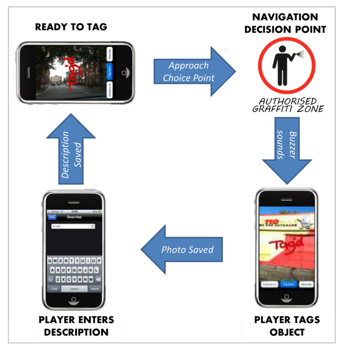
Figure 1. Flow diagram of the graffiti tagging game.

the description, they selected the "Done" button and the app returned the player to the main 'home' screen, ready to tag an object at the next location (see Figure 1).