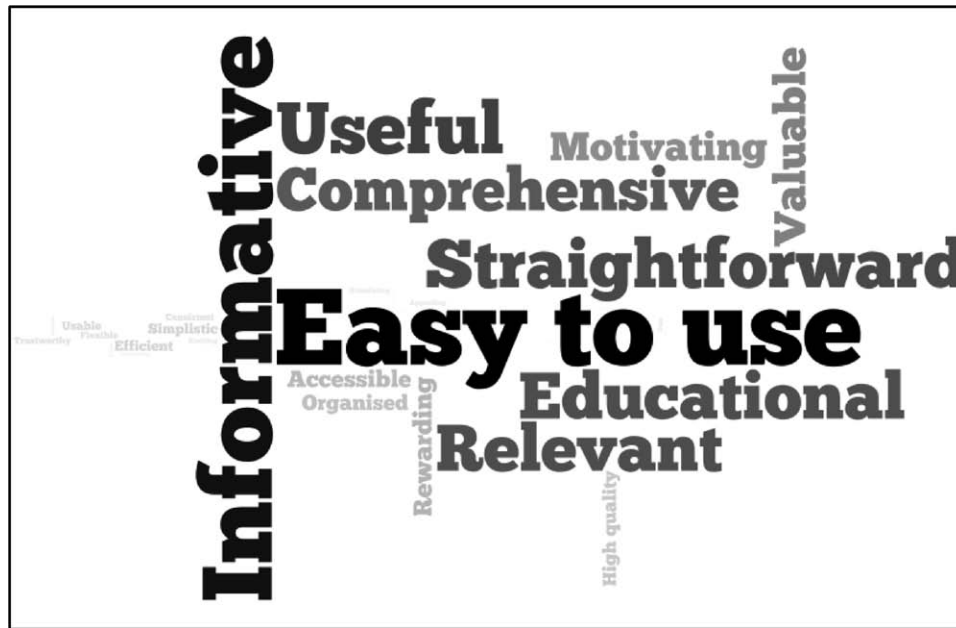
Fig. 3. Wordcloud to show the top five words to describe the reusable learning objects. The larger the font size, the more frequently the word was selected.

population. However, compared with those who presented for hearing assessment, our recruited sample were younger, had better hearing, and there were fewer women. It is likely that these significant differences resulted from the study eligibility criteria. For example, despite our best efforts to maximise accessibility to the RLOs, the main reason for nonparticipation was because a large number of patients, around one-fifth, could not access the RLOs as they did not have access to a DVD player, PC, or internet. Although we expected PC and internet use to be low (Henshaw et al. 2012), lack of access to DVD was poorer than expected given the percentage of households in the UK with DVDs in 2012 was 87% (Statista 2015).