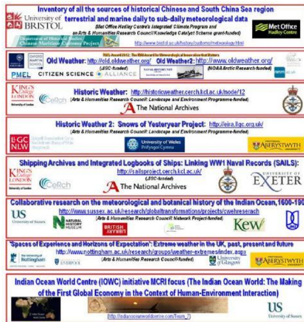
Figure 2: ACRE collaborations with Citizen Science, Social Sciences, Humanities and Arts projects

These collaborations (Figure 2), have led ACRE, and its wider community, to begin to go further, and to look at integrating historical 20CR reanalysis output with broader social, historical, cultural, environmental research from the social sciences, humanities and arts communities. Here, we briefly review the nature of some of these collaborations.