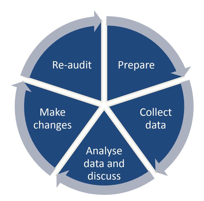
Figure 1: The clinical audit cycle

The clinical audit process is commonly described and depicted as an audit cycle. The general process of audit can roughly be broken down into a five step cycle, as shown in Figure 1. A topic should be chosen to audit and preparations made in relation to the logistics of how the audit will be carried out. Data is then collected and analysed, and a discussion held to decide if and how changes need to be made. Those changes are implemented, and a re-audit run to see what effect they may have had.