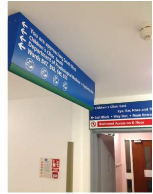
Fig. 4: Restricted access issues

In sections III-A - III-E we describe in full each sub-category identified for the themes above. In some cases the category is illustrated by a quote from one of the interviews.