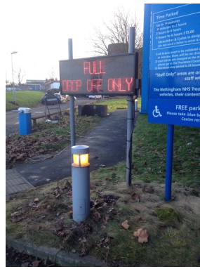
Fig. 2: Inadequate, Inconvenient parking