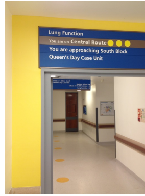
Fig. 3: Information recognition issues