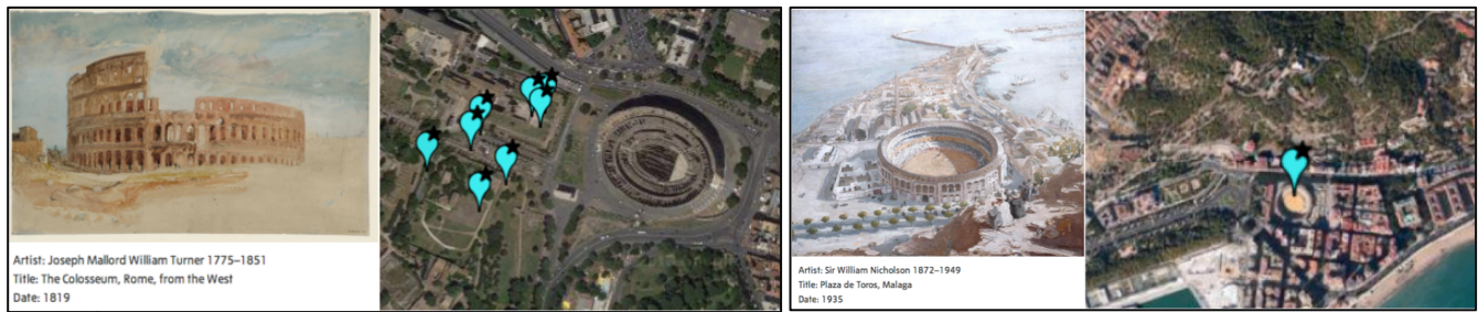
Figure 2: Multiple suggestions tagged to the artist’s perspective in relation to J.W.M Turner’s ‘The Colosseum, Rome, from the West’ (left) and a tag for Sir William Nicholson’s ‘Plaza de Toros, Malaga’, on the geographic feature depicted (right).

Even abstract works often take inspiration from locations, and in some cases were tagged based on their titles, such as ‘Teatro Olimpico’, or ‘Oxford Street’. Again, investigation prompted by the request to map can lead to new discoveries and understanding. For example on Robert Delauney’s ‘Windows Open Simultaneously (First Part, Third Motif)’, a tag was added to the Eiffel Tower with a comment that: “I chose this object because I like the colour and abstraction.... I didn’t realise it was of the Eiffel Tower until I read the blurb on the website. It was easy to map this location for the content in the image, but not sure if the mapping should only be for what we can see in the image” (P10, platform).