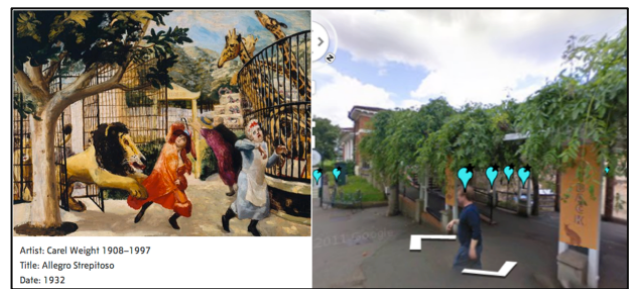
Figure 3: Clustered suggestions in Regent’s Park Zoo, London, made in relation to Carel Weight’s ‘Allegro Strepitoso’.

geographic location was not easily identified - further tags for Allegro Strepitoso suggested both of these. Outside of the works suggested in the tasks, others such as Edouard Vuillard’s domestic scene ‘The Laden Table’ were connected to the artist’s home with a comment that “it seems best to fall back on the original place the artist painted the work as a starting point” (P14, platform). Contrary to the artist’s intent to be ambiguous with space, the prompt to locate the work leads to investigation to find a relevant location, making visible the context and history.