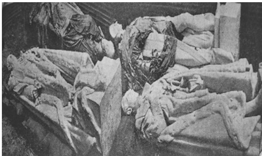
Figure 3. 'Paths of power lead but to the Museum', The Statesman , 11 July 1965. Image of British viceroys and generals 'dumped' at the Exhibition Ground. Source: Extract from The Statesman , 18 July 1965, DO 170/54, TNA. Reprinted with permission.

statuary: Coronation Park, a site in the outer suburbs of Old Delhi which, appropriately enough, had staged George V's imperial darbar . The British were less convinced of the site's suitability. While conceding that statues placed in Coronation Park, 'might be out of sight and out of mind', in another sense, British officials worried that 'statues in this remote spot would not be looked after properly and that ill-disposed persons might easily mutilate them without anyone noticing for a long time'. 129