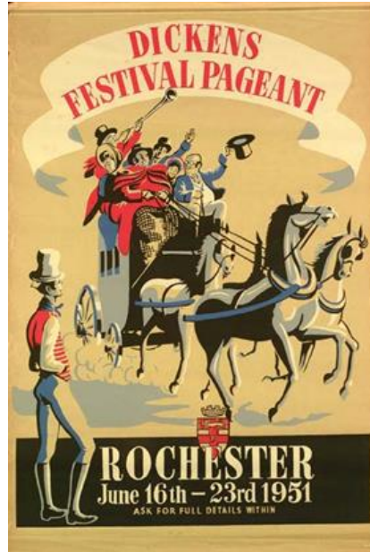
Fig. 2: Festival of Britain poster 13

With the great number of Dickensian celebrations of 2012, this was arguably the year of ‘neo-Victorianism par excellence ’, 14 and it was thus fitting to see Victorian symbols take visual prominence in the aesthetics of the Opening Ceremony. Yet amidst this spectacle, Dickens himself was nowhere to be seen, his presence and texts curiously absent from the stage which instead saw a turn to Shakespeare’s words spoken through the figure of Brunel. Again, though, this was in some respects a suitably neo-Victorian moment: it was, after all, the Victorians who solidified Shakespeare’s status as national symbol through the consolidation of Bardolatry and