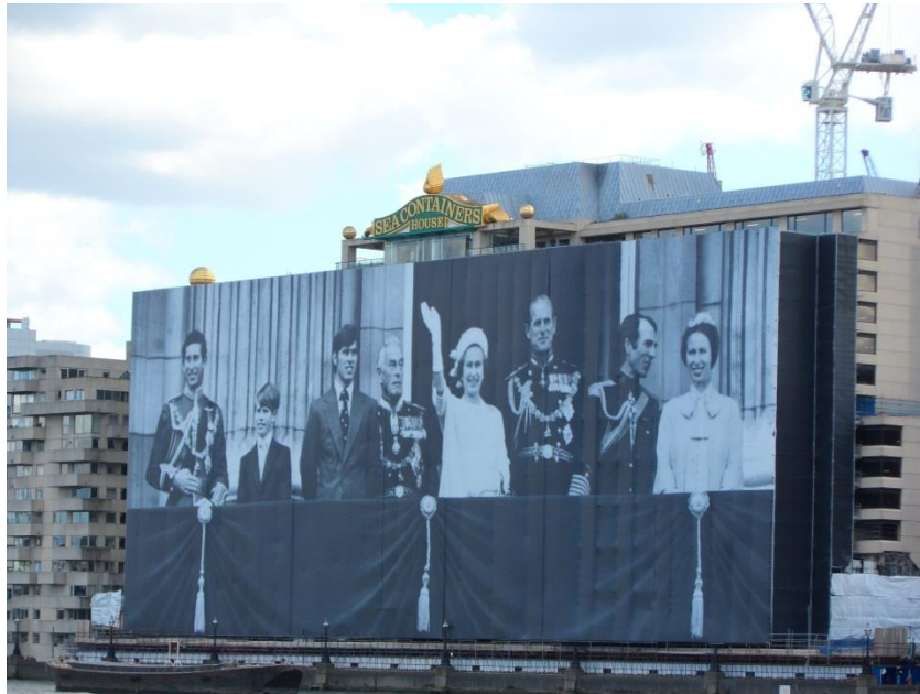
Fig. 1: image of the Royal Family at the Queen's Silver Jubilee of 1977 on the River Thames

nation's history, as a prominent and meaningful site (for other reflections on the 'spectacular city', see Stuart Hampton-Reeves in this volume).