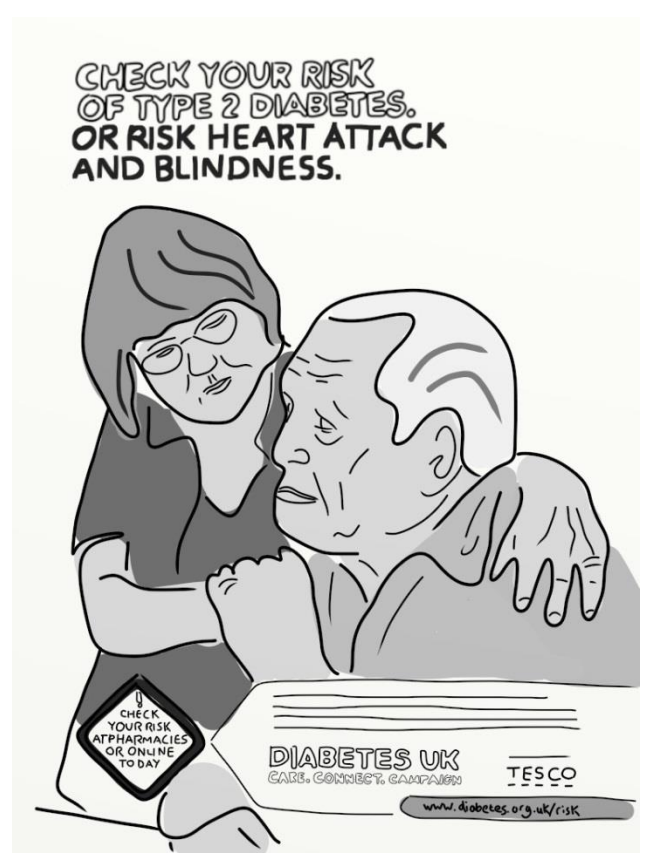
Figure 6. Elderly woman comforting elderly man.

use of close-up camera shots and the positioning of the viewer, frontally, rather than at an oblique angle with the photographed scene (Jenkins 2007: 97). This visual-spatial effect aligns the observer with the represented, including them directly, head-on, in the domain of the suffering participants. In fact, what we have is a kind of blurring, merging of worlds (the viewers' and the participants'), a visual configuration which suggests that diabetes is your (the viewers') problem too – that the disease is liable to affect you and your family in the same way that it has affected, and continues to affect, these people. In other words, the images promote the idea that you, the audience, live 'in the shadow of serious illness' (Radley, 1999: 780) – that there (for the moment at least) but for the grace of God go you.