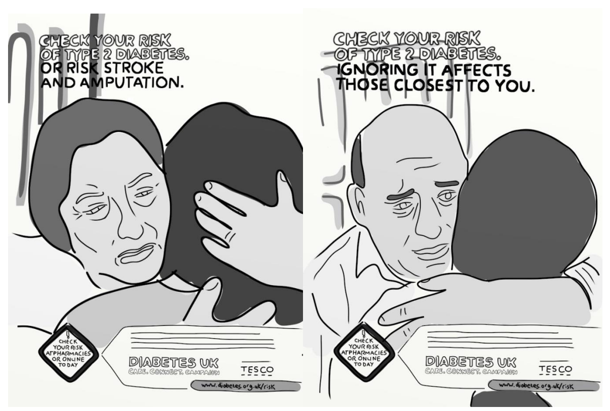
Figure 4. Two women in close embrace.