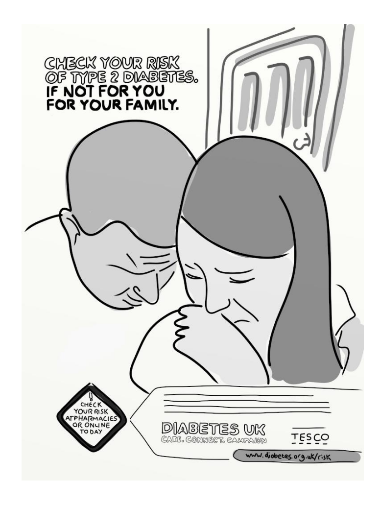
Figure 3. Weeping woman and older man.

Here the actors' heads are angled inwards towards one another, converging, touching, as if in reciprocal support. A tear from the daughter's left eye, clearly visible in the brightly illuminated setting, streaks down the length of her cheek to underneath her chin. The participants appear not to be speaking, but rather inhabit a stunned silence, numbed, as it were, by the awfulness of their situation, a predicament (whatever it precisely is), presumably, too dreadful for words. Similarly, in both figures 4 and 5, two people (again, we assume, family members) are depicted in a close, consoling embrace, however in these photographs the embrace is much more physical, firmer, deeper – a hug rather than a touching of heads.