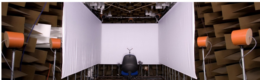
Figure 3 Testing apparatus. The apparatus that will be used to assess the sound localisation accuracy and speech understanding of patients in the trial. An array of loudspeakers and a visual projection system are positioned within an anechoic chamber. Thirty-six loudspeakers are distributed horizontally around the listening position with an additional 6 loudspeakers suspended above the listener and a further 6 loudspeakers positioned below the listener. The three visual projection screens are driven by three high-definition projectors. Responses are recorded using a trackball (localisation task) or through an intercom (speech understanding task).

The original speech waveforms will be presented after being convolved with the room impulse of a simulated room, the methods and parameters of which have been described previously [30]. The ratio between the direct