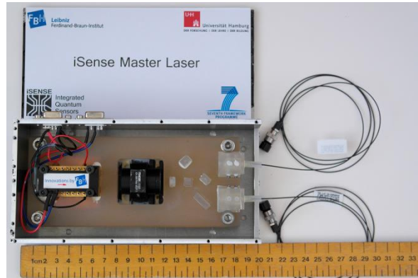
Fig. 1: Microintegrated DFB laser with two output ports.

The microintegrated laser modules are mounted on miniaturized optical benches which provide mechanical protection, beam splitting, high power optical isolation and fiber coupling into polarization maintaining optical fibers. Thermal and mechanical stability are ensured by proprietary optical mounts and either linear or Zerodur based construction, ensuring high levels of fiber coupling over large temperature ranges.