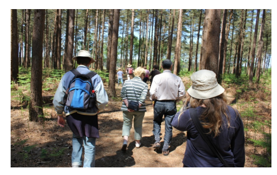
Figure 3 Bio Blitz in the New Forest National Park

Amateur naturalists self identify with the term and distinguish themselves from the professionals despite the fact that sometimes they are just as knowledgeable as a result of their long-term engagement with species recording. Very often, they are locals, residents near a park area that work closely with the county recorders in regular, organized group surveys or people who just record things on their own while walking the dog.