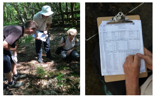
Figure 4 Amateur naturalists surveying species on paper

The emotional attachment to their work is also reflected in the professionals' view of surveys and the tools used for surveying. Despite the advances and availability of technology in this digital era, professionals tend to conduct