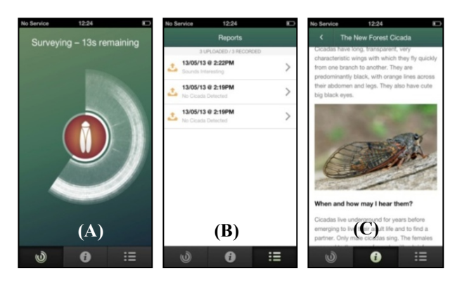
Figure 1 'Cicada Hunt' mobile phone application

The final design (called 'Cicada Hunt') included a sonogram, which was used to visualise the algorithm, taking inspiration from the popular music application Shazam (www.shazam.com) and drawing on a user's likely familiarity with it. The sonogram was thus visualised in a circular way, as opposed to the more commonly found horizontal format. The sonogram displayed the real-time fluctuations relating to the audio's frequency and amplitude. This detail was not only intended to act as a means of education for users about frequency and sound, but also to speak to professionals who frequently make use of sonograms. Interaction with the application was designed to be as simple and lightweight as possible, in order to serve