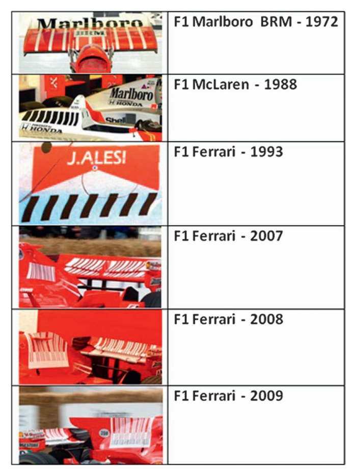
Figure 6 The evolution of the Marlboro barcode.

techniques known as 'trademark diversification' and 'alibi marketing'. <sup>61</sup> Trademark diversification involves the use of a cigarette brand name on the branding of other and typically unrelated products, such as clothing. <sup>62</sup> Alibi marketing involves distilling a brand identity into its key components, such as the distinctive red and white colouring associated with the Marlboro brand, or the shade of purple used by Silk Cut, and using these to promote the brand in place of a conventional logo or trademark. <sup>63</sup> This study was carried out to assess the validity of Ferrari's assertion that barcode design displayed on their F1