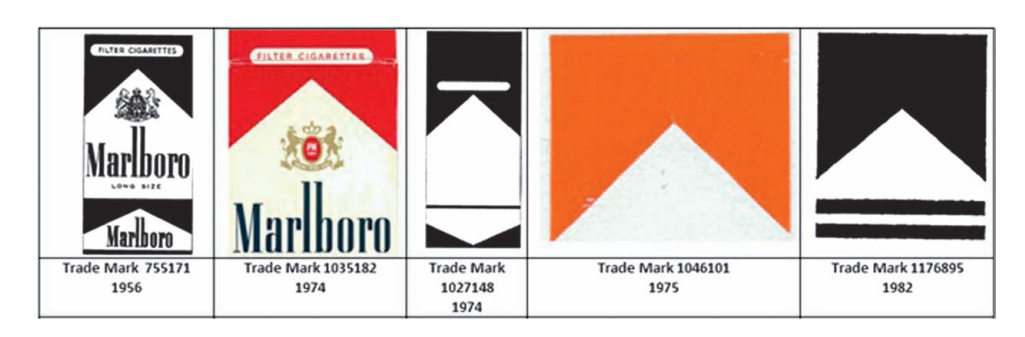
Figure 3 A selection of Philip Morris trademarks registered in the UK 1956—82.

When challenged by a series of media reports in early 2010 that the barcode design was in reality a Marlboro logo, Ferrari responded that 'the so called barcode is an integral part of the livery of the car and of all images coordinated by the Scuderia, as can be seen from the fact it is modified every year, and,