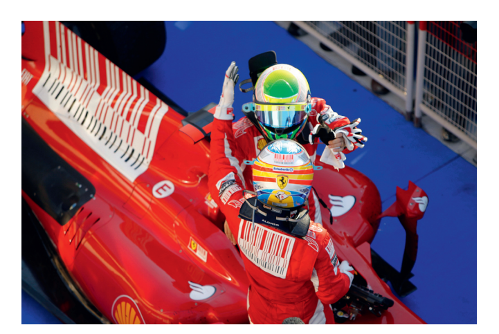
Figure 7 Marlboro 'barcodes' on both the Ferrari race car and the driver's clothing in early 2010.

techniques known as 'trademark diversification' and 'alibi marketing'. <sup>61</sup> Trademark diversification involves the use of a cigarette brand name on the branding of other and typically unrelated products, such as clothing. <sup>62</sup> Alibi marketing involves distilling a brand identity into its key components, such as the distinctive red and white colouring associated with the Marlboro brand, or the shade of purple used by Silk Cut, and using these to promote the brand in place of a conventional logo or trademark. <sup>63</sup> This study was carried out to assess the validity of Ferrari's assertion that barcode design displayed on their F1