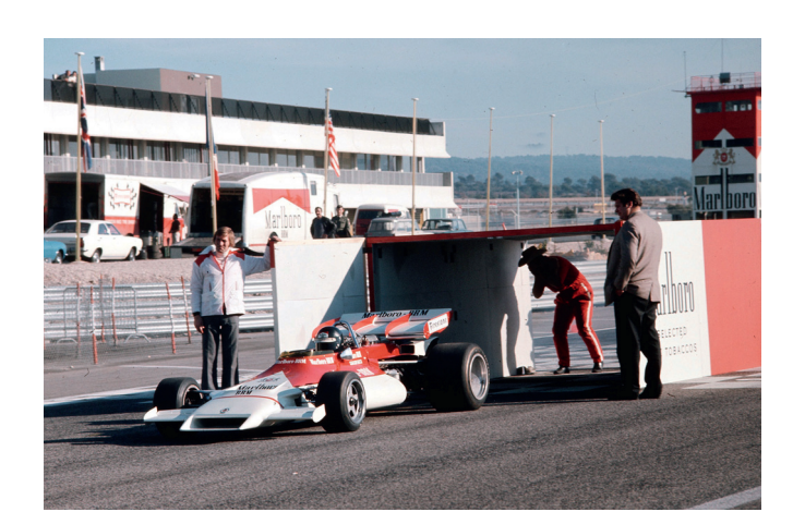
Figure 1 Marlboro branded BRM F1 car emerging from a mock-up of a giant Marlboro cigarette pack in 1972.

The Ferrari F1 team traditionally races in Italy's historic national motor racing colour, red. Philip Morris documents reveal that the company has long recognised the importance of association with Ferrari, and the red colour schemes shared by Ferrari and the Marlboro brand. Only once in F1 has Marlboro made use of a colour other than red, at the 1986 Portuguese F1 Grand Prix, when McLaren ran one car in a gold and white