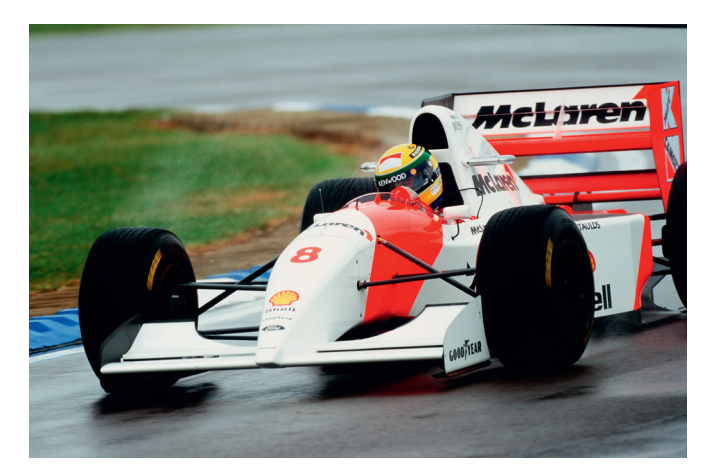
Figure 4 Substitution of Marlboro with McLaren on a McLaren F1 car in 1993.

occasionally even during the season. Furthermore, if it was a case of advertising branding, Philip Morris would have to own a legal copyright on it'. <sup>59</sup> An article on a motorsport website (http://www.autosport.com/) quoted from a Scuderia Ferrari Marlboro press release, which said that criticism was 'based on two suppositions: that part of the graphics featured on the Formula 1 cars are reminiscent of the Marlboro logo and even that the red colour which is a traditional feature of our cars is a form of tobacco publicity...neither of these arguments have any scientific basis, as they rely on some alleged studies which have never been published in academic journals. But more importantly, they do not correspond to the truth'. <sup>60</sup>