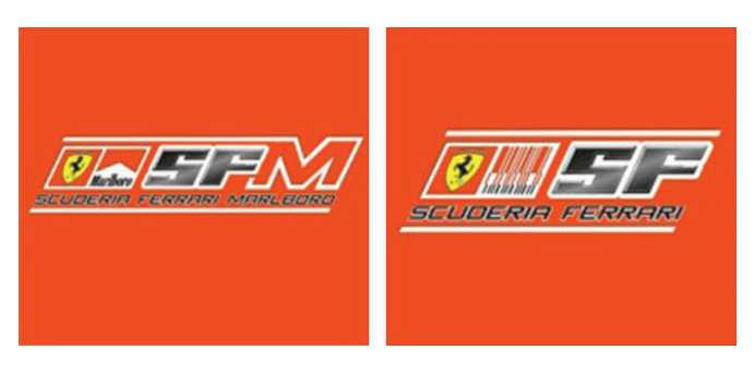
Figure 2 Ferrari F1 team names and logos, 2007 and 2010.

livery. This was to promote Philip Morris' new Marlboro Lights brand of cigarettes. The colour did not work on television and the experiment was never repeated.<sup>33</sup>