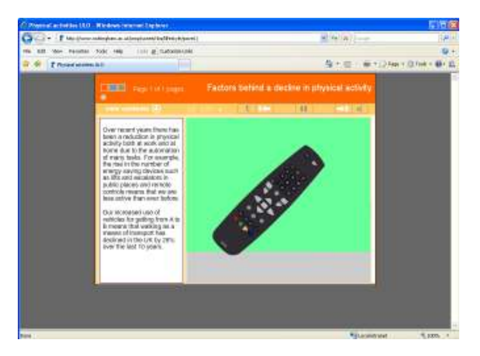
RLO2: Keeping Physically Active

Available at: <a href="http://www.nottingham.ac.uk/nmp/sonet/rlos/lilfestyle/pave2/">http://www.nottingham.ac.uk/nmp/sonet/rlos/lilfestyle/pave2/</a>