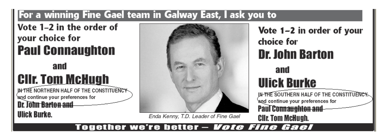
Figure 3: Segment from Fine Gael election flyer, instructing voters how to order their votes (see areas indicated by ellipses)