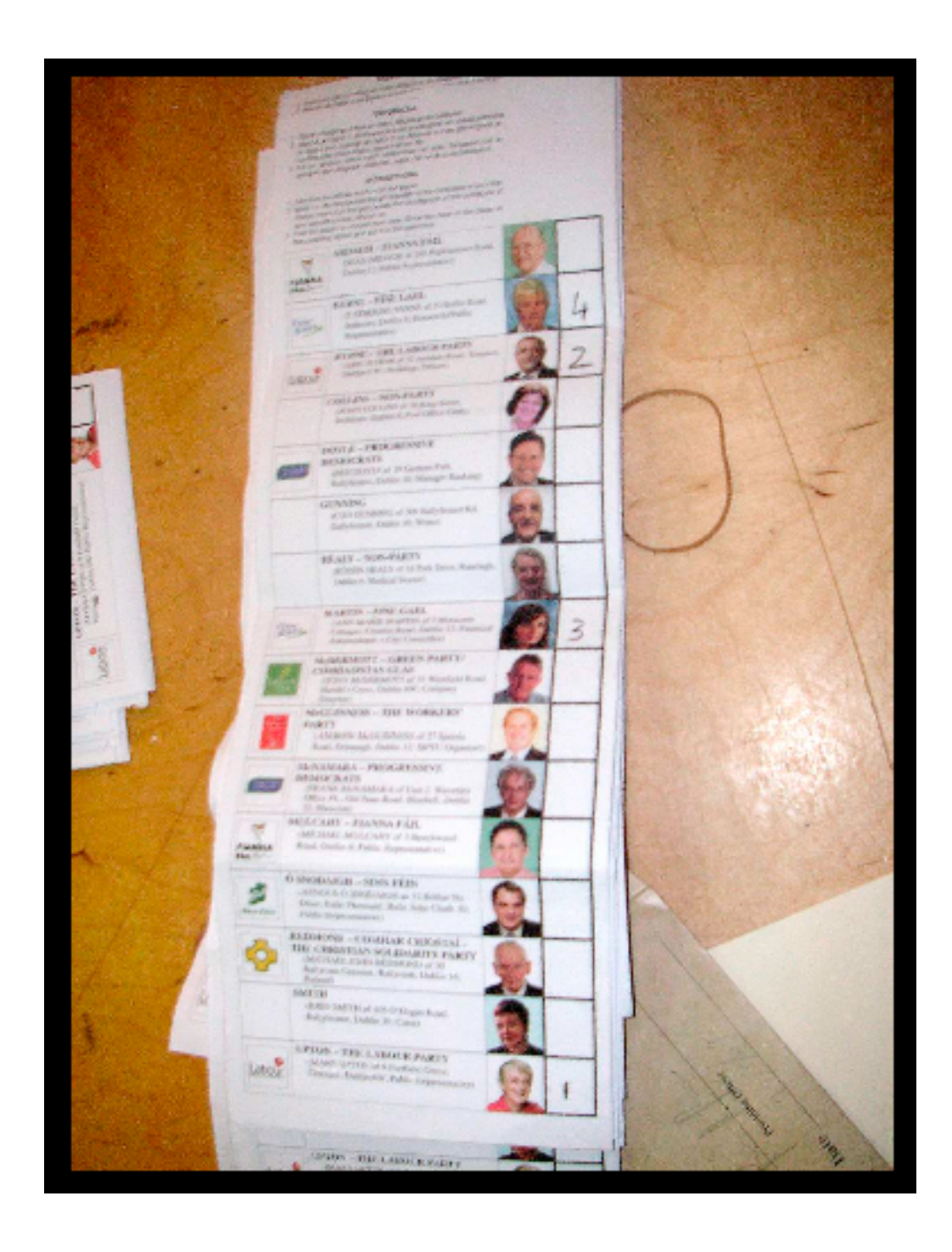
Figure 2: Irish 2002 ballot with 4 preference votes marked

supporters in an area to vote for particular candidates. Therefore they instruct their followers in great specificity as to how to order their preferences over candidates, as illustrated in Figure 3.