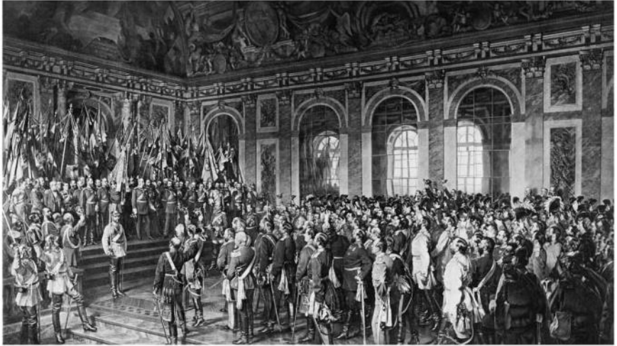
Figure 3. A von Werner, The Proclamation of the German Empire , Palace Version (1877)

the same breath, proceeded to outline their ‘equitable’ claims 132 as against those of Germany; or, at least, those equitable claims that Germany was assumed to have, 133 as it had not been given a recognised platform to make those claims known. So much for the ‘free, open-minded and absolutely impartial adjustment of all colonial claims’ that had been promised: Germany’s ‘overseas possessions’ would now set sail on a different course, 134 ‘such peoples form[ing] a sacred trust of civilization’ as proclaimed by Article 22 of the Covenant of the League of Nations. 135 More problematic still was the projection of the ‘interests’ (as opposed to the ‘equitable claims’) of ‘the populations concerned’ whose ‘exploitation should be conducted on the principle of the “open door”’. 136 Where, though, were the Tanganyikans, the Cameroonians, the Togolandese at Paris? How were their interests ever to be made known? Were they not entitled to speak of and for themselves? And why was what was