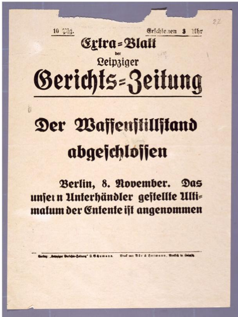
Figure 1. 'Armistice Accepted. Berlin, 8 November. The Entente ultimatum presented by negotiators is accepted'. Leipzig Court Journal .

this intensity of emotion carried through to the supplement to the Leipzig Court Journal which read, in an arresting graphic that is reproduced here, 'Armistice Accepted. Berlin, 8 November. The Entente ultimatum presented by negotiators is accepted' (Figure 1).