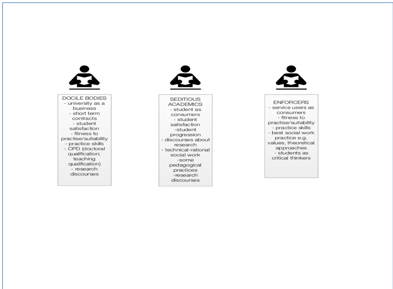
Figure 2: Positions of social work academics in relation to competing normalising judgements