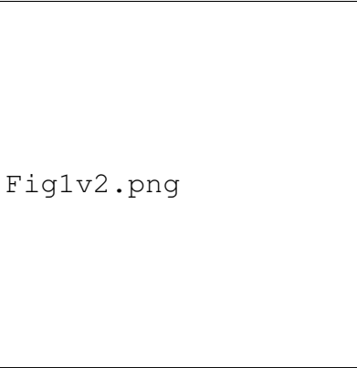
Figure 1: Lattice domains in homo- and hetero-bilayers of MoS 2 and WS 2 . Low magnification ADF STEM image of periodic domain array for various twist angles, scale bar 100 nm. Atomic schematics insets illustrate parallel and antiparallel orientation of the lattices disregarding the local stacking configuration. Color highlights different types of domains.