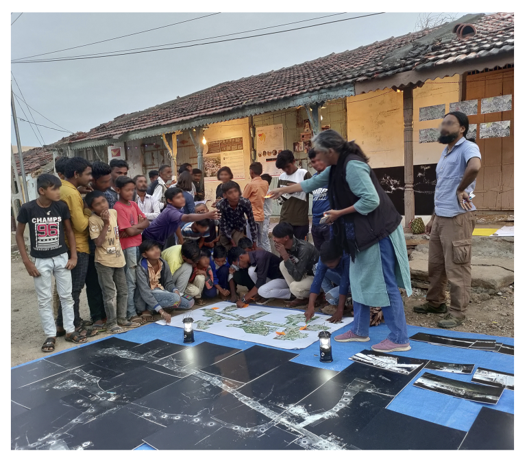
Source(s): 3D for Heritage India Research Project. Author: B. Devilat