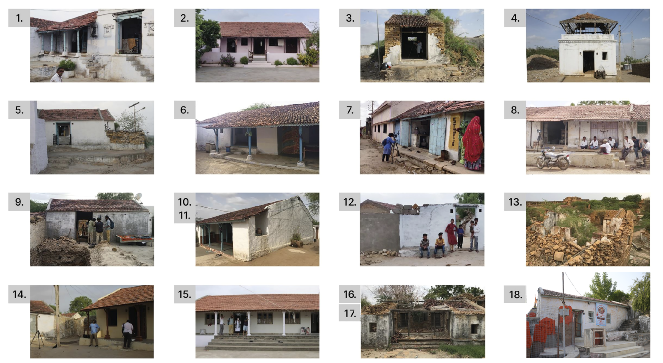
Plate 5. Photos of the buildings selected for interior scanning in Bela. July 2021