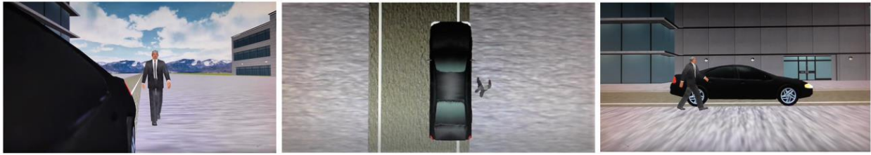
Figure 1: Examples of egocentric (left), top view and side view (right) used in the study

addition, images can be dynamically augmented to highlight potential hazards, or completely re-imagined to create previously unavailable viewpoints and new digital visualisations. For example, exocentric points of view (“from outside, looking in”) can be reconstructed using vehicle-based cameras and sensors (much like current camera-based parking aids) that can provide vehicle users with a novel third-person view. The aim of this study was to compare existing egocentric (‘reflected’) views with novel, exocentric visualisations to help drivers locate a passing pedestrian.