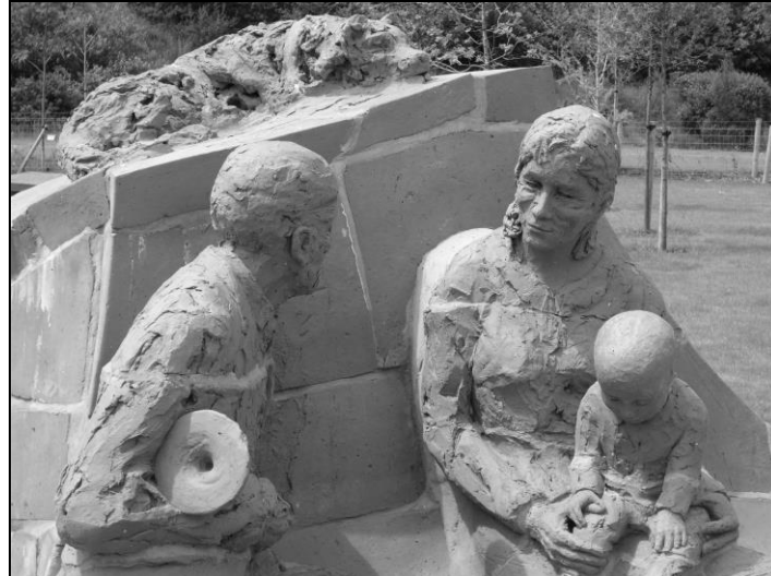
Taken from:(Gregory 2008: 49)

Additionally, time bank expansion can occur when members approach the agency with their own ideas. Here local people themselves have taken the initiative to develop means of earning credits – for example, a cooking class devised by a local resident. She discussed the idea with the time broker in order to secure facilities and resources to provide the class to local people. A similar development also occurred when a group of local people wished to develop a local heritage group through the development trust. Here we start to see a shift of power relations, as local people engage actively with the agency to develop projects and classes. Consequently, the person-to-agency model has some different features to Cahn's original model.