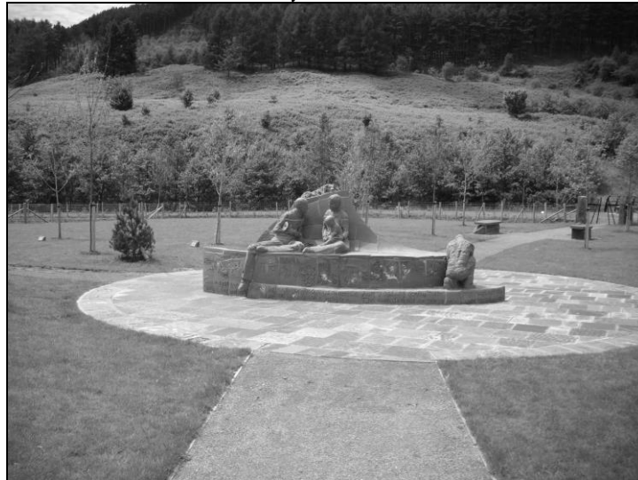
Taken from: (Gregory 2008: 48)