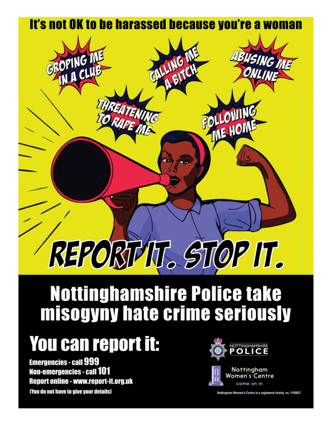
Figure 3. Nottingham Police take misogyny hate crime seriously.