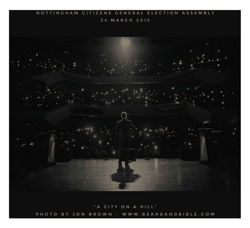
Figure 2. A city on a hill, the Nottingham citizens general election assembly, 24 March 2015. http://www.beardandbible.com/blog/2015/getting-the-shot?rq=citizens. Permission to use the image granted by the photographer, Jon Brown.

branding of this image and of the subsequent communications about the event as the dreaming of Nottingham as a 'city on a hill', and the religious symbolism this implied, made some members uneasy (see section on critique below).<sup>4</sup>