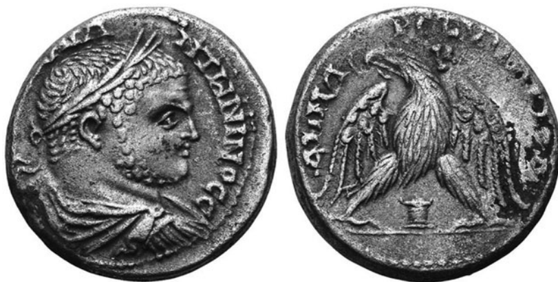
Fig. 2. Tetradrachm of Caracalla minted at Neapolis, 215–17 CE (27 mm, 12.2 gm), shown twice actual size in print. Bust / Eagle standing facing, small altar between talons. (Bibliothèque Nationale de France Y 19622.)

The four coins presented here (Figs. 1–4), each with a different kind of mintmark, are a case in point. They have until now been attributed to two different cities, Neapolis in Palestine and Byblos in Phoenicia. One type shows a panoramic view of Mount Gerizim (Fig. 1), the sacred mountain of the Samaritans that adjoined Roman Neapolis in Palestine. This is a motif very often seen on coins of Neapolis and hence identifies the issuing mint with certainty. 4 The other three types show altars of various sizes: small, large, and extra-large (Figs. 2–4). 5 Of these, only the coins with the small altar mintmark (Fig. 2) were known to Bellinger at the time. With the tiny altar mintmark on the reverse his only clue, he found altars of comparable shape on the bronze coins of Byblos and, on the strength of this comparison alone, attributed the tetradrachms to Byblos. As the large and extra-large altars became known, Bellinger's successors followed suit with the same attribution. The frailty of this identification is evident, but the attribution is universally accepted today and perpetuated without question in museum, collection, and sales catalogues.