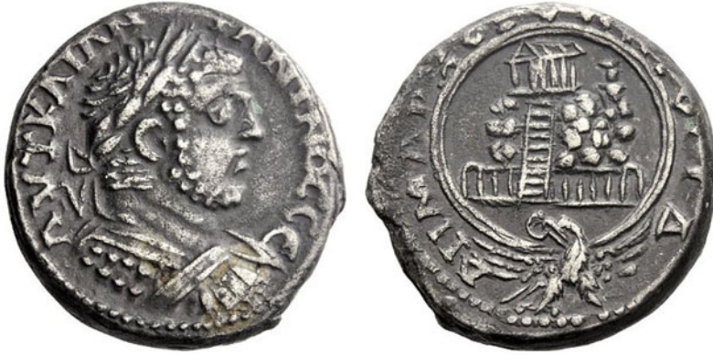
Fig. 1. Tetradrachm of Caracalla minted at Neapolis, 215–17 CE (26 mm, 13.3 gm), shown twice actual size in print. Bust / Mount Gerizim within double circle, supported by eagle facing.