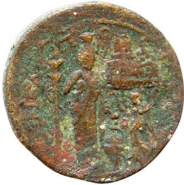
Fig. 8. Civic bronze of Neapolis minted under Volusian, 251–53 CE (24 mm, 9.0 gm), shown twice actual size in print. Reverse: Kore standing, holding long torch entwined by serpent; at right, Nike supporting a model (?) of Mount Gerizim. (Yale University Art Gallery 2001.87.12652.)