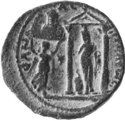
Fig. 10. Civic bronze of Neapolis minted under Trebonianus Gallus, 251–53 CE (26 mm, 11.0 gm), shown twice actual size in print. Reverse: Kore standing in distyle shrine next to cista mystica ; at left, Nike supporting a model (?) of Mount Gerizim. (From the Sofaer Collection at The Israel Museum.)

This means that, for images where only one of them appears, it is impossible to tell on purely iconographic grounds whether it is one or the other. But there are good reasons to consider Kore the more likely option: first, the narrative scenes depicted on these city coins involving the Eleusinian goddesses are focused on the story of Persephone. Her abduction to, and seasonal return from, the underworld takes center stage and was evidently deemed worth conveying and promoting, to such an extent as to have it put on the city's official currency. The story evokes symbolic connotations about death and regeneration, concepts of essential value to initiates into the mystery cults. 28 Secondly, in Roman Palestine, local cults of Kore are attested, at Sebaste, Neapolis, and Gaza, whereas there is no clear evidence for a cult of Demeter, unless it was combined with worship of Kore. 29