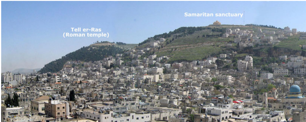
Fig. 12. View from Nablus towards the southeast, with the twin peaks of Mount Gerizim. (Photo from https://commons.wikimedia.org/wiki/File:Nablus_panorama.jpg ; licensed under a Creative Commons Attribution-Share Alike 1.0 Generic License ( https://creativecommons.org/licenses/by-sa/1.0/deed.en ); text added by author.)

There can be no doubt that this was a key monument in the city of Neapolis. Its significance can be gauged from perusing the imagery on Neapolis tetradrachms in toto. The emission of Caracalla reviewed here includes Mount Gerizim and three different kinds of altars (small, large, and extra-large) all issued contemporaneously and, in one instance, even linked by a shared obverse die (Figs. 1–4). These three versions no doubt all refer to the same monument, with the largest version a one-issue deluxe type offering more detail. But there is more to it: the altar is the mintmark of Neapolis tetradrachms. Very rare special editions (like the Mount Gerizim issue) aside, the altar was the only symbol that the Neapolis mint invariably picked to represent the city on its silver currency. 35 Where Tyre used the club of Melqart as the civic emblem on its tetradrachms, and Sidon an image of Europa on the bull, Neapolis had its altar. The importance of this altar as a civic icon can therefore hardly be overstated.