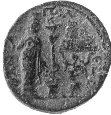
Fig. 9. Civic bronze of Neapolis minted under Trebonianus Gallus, 251–53 CE (25 mm, 11.9 gm), shown twice actual size in print. Reverse: Kore standing, flanked by long torch entwined by serpent; at right, long torch, cista mystica, Nike supporting a model (?) of Mount Gerizim. (From the Sofaer Collection at The Israel Museum.)

close enough, and at the same time these features are distinct enough from other deities, to be able to identify the figure as Kore Persephone. The staff in her right is then a long torch, and in her left she was probably meant to be holding grain ears.