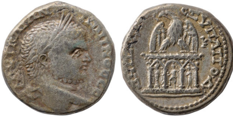
Fig. 4. Tetradrachm of Caracalla minted at Neapolis, 215–17 CE (26 mm, 13.1 gm), shown twice actual size in print. Bust / Eagle perched on monumental altar. (Bernisches Historisches Museum, Bern, inv. no. 82.2368. Photo: Christine Moor. Reproduced with permission.)