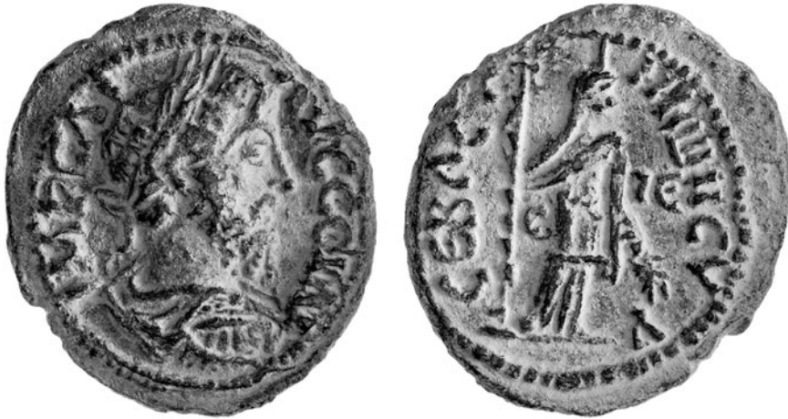
Fig. 7. Civic bronze of Sebaste minted under Commodus, 187/88 CE (30 mm, 13.1 gm), shown twice actual size in print. Draped bust / Kore standing r., wearing kalathos on head, holding ears of grain and long torch. (From the Sofaer Collection at The Israel Museum.)

features, as an ancient idol standing stiffly upright, wearing a kalathos on her head. 22 One can just see her forearms jutting out horizontally from her torso. From her hands there are vertical lines toward the ground; these are presumably the woolen fillets. The Ephesian Artemis is known for her distinct tight-fitting apron ( ependytes ), which is decorated with busts and animal protomes. On the coins these are rendered with tiny dots. Her acolytes, normally one stag to either side, are barely discernible.