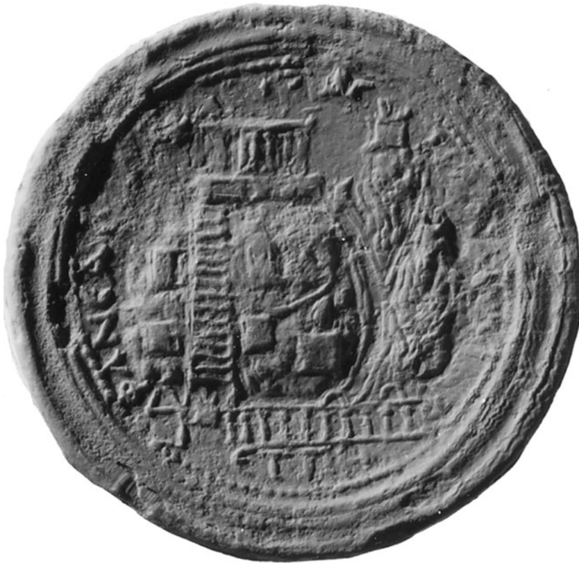
Fig. 11. Bronze medallion of Neapolis minted under Antoninus Pius, 159/60 CE (54 mm, 53.6 gm), shown twice actual size in print. Reverse: panoramic view of Mount Gerizim. (From the Sofaer Collection at The Israel Museum.)

to move it into the center of the composition behind the cista. This made for a more balanced and economical composition, though a far cry from the original intent of the image.