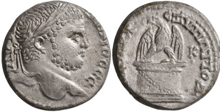
Fig. 3. Tetradrachm of Caracalla minted at Neapolis, 215–17 CE (25 mm, 11.3 gm), shown twice actual size in print. Bust / Eagle perched on large altar. (Bibliothèque Nationale de France 1989.212.)