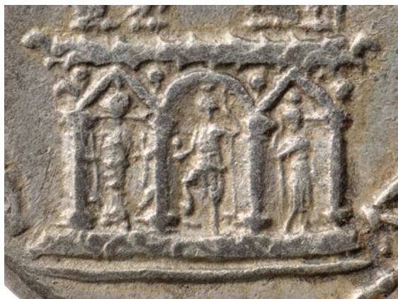
Fig. 5. Detail of the reverse of the tetradrachm in Fig. 4.

consistently at the top of the list for their respective mints, suggesting that they were issued first. There is however, for lack of in-depth die studies, no solid chronological evidence to suggest that these were indeed inaugural issues. They could have been minted at any point, perhaps, for example, to celebrate special occasions. 8