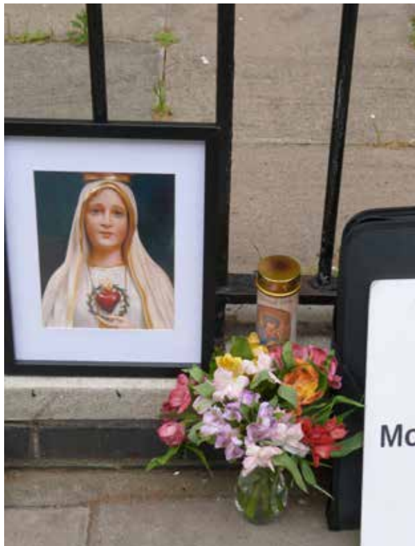
FIGURE 1. Pavement display in London, 2019

From the activists’ “life from conception”