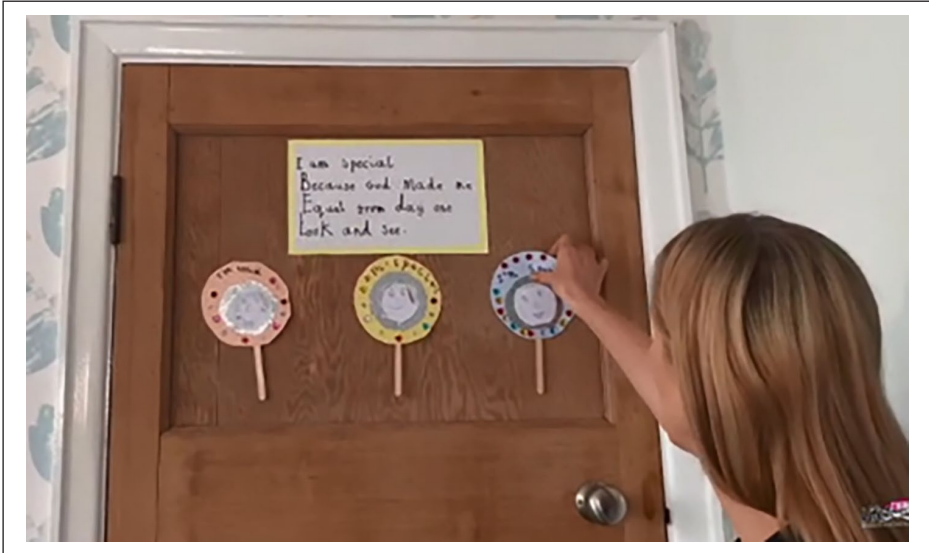
Figure 1. Craft activity.

Sadly they have made up wrong laws to say you can't be included in our country if you are a baby. Just because you still have to spend a bit of time in your mummy's tummy before you are born. They have also made some really sad laws, and those laws say, if you need some special care, if you need some special love, you can be left out of our country's life and joy, we are not going to include you.