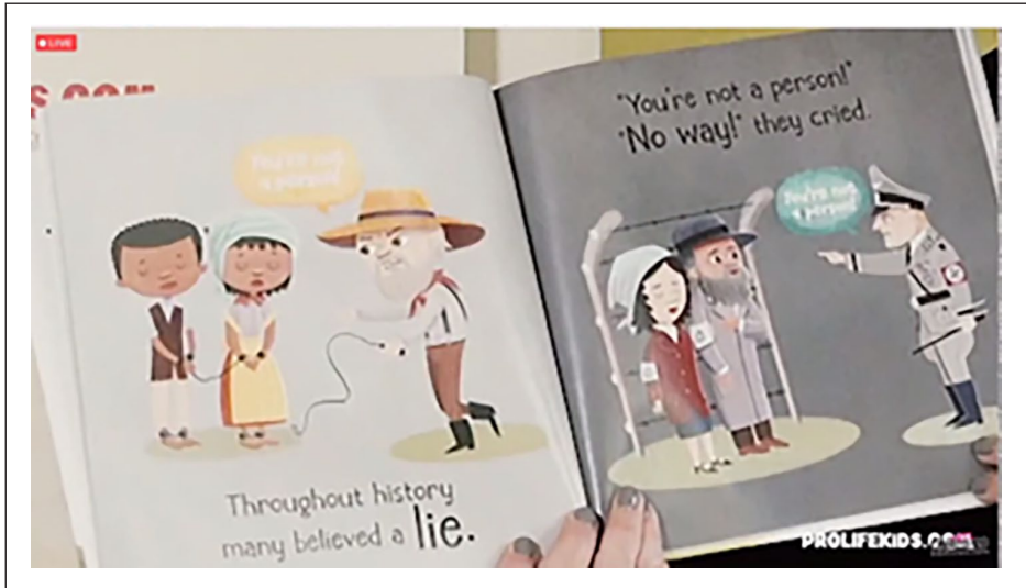
Figure 2. Slavery and Holocaust comparisons.

into movement actors. However, not all parents in the anti-abortion movement seem to be comfortable with this level of involvement of younger children.