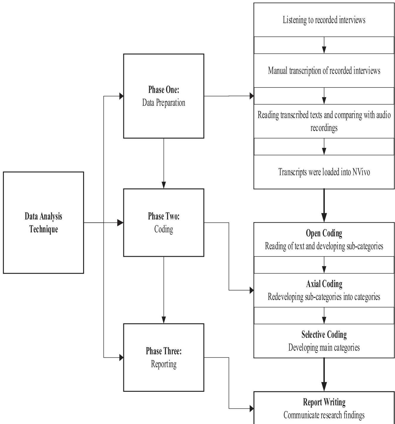
FIGURE 1 Data analysis procedure.