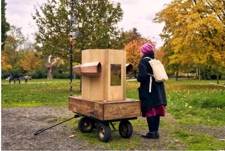
Figure 1: A participant ‘speaking to the future’ with Future Machine in London.

In this paper we propose that employing strategies of myth making, entangled interactions and sustainability are central to the design of this interactive device. Each of these strategies enables new ways of considering participatory design in the context of human-nature-technology interactions. These strategies expand on the more ‘standard’ approaches and framings by which we traditionally consider Human-Computer Interaction, whilst widening the debates around the human-nature dichotomy. Whilst the notion of myth-making might appear to be somewhat radical when we look at the fields of Human-Computer Interaction, design and data-driven experiences, we are working in and around the topic of climate change. The nature of this topic is such that the impacts take place at different scales, on a global and personal level, upon communities, continents and countries, and the speed by which climate change is impacting upon us is changing our perceptions of what was and is to come. This uncertainty about the future is not something which standard approaches and methods to understanding design and user experience tend to deal with, but, we propose that humans are able to look at the world through a range of lenses and in doing so are able to share ideas, myths and concepts about how we might work with others (humans and non-humans) in a more responsible way, to address our concerns of what the future may hold.