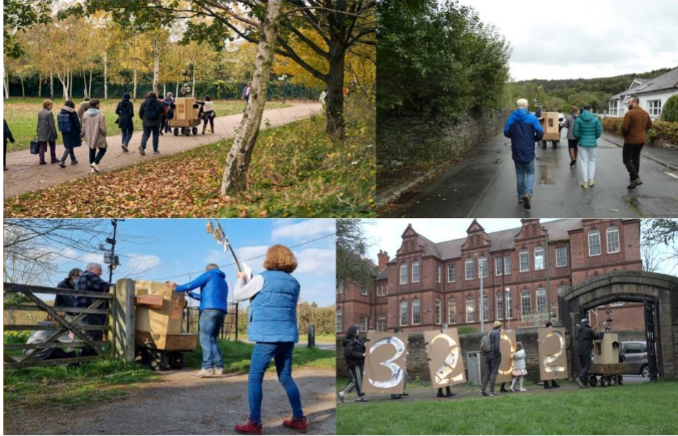
Figure 7: Left to right - Future Machine appearing in Finsbury Park (London), Backbarrow (Cumbria), Rotherfield Peppard (Oxfordshire), Christ Church Gardens (Nottingham).

inciting people to come back together, rather than it being on a more like practical or technological term, that it's something that's embedded in nature that brings us back together.”