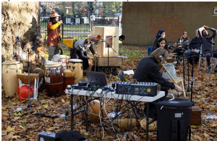
Figure 6: The musicians and Future Machine performing the autumn weather in Finsbury Park

The music is played out when the lever is in the 'present' position, the layered sounds change as the data changes, creating endlessly new sound formations. The music was created by the collaborating musicians who responded to weather words written by the lead artist, composing the music using pre-composed sound palettes and motifs. These were then edited into separate files that are layered together in response to the data. The music is inspired by the lead musician's West African heritage and traditions, coming from a family of traditional rainmakers in rural Burkina Faso – which has given the name 'The Rainmakers' to the musicians who perform the weather live, along with Future Machine, as part of the annual ritualised meetings in Finsbury Park.