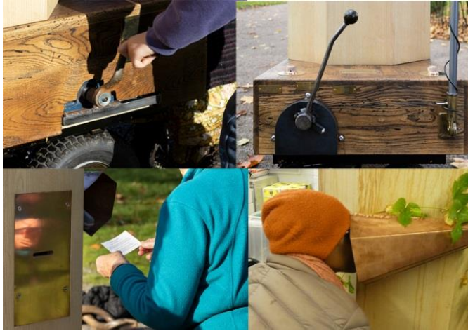
Figure 3: Left to right, turning the handle to power Future Machine, the lever and dials at the back of the base, a woman reading a print out, a woman speaking into the trumpet.

The live weather data is turned into layered music that is played by turning a lever at the back of the machine to the ‘present’ position. Participants turn 4 dials on the base that combine local and global data collected by the artist and climate scientist. These inform stories that are printed out when the lever is in the ‘future’ position. At the bottom of these stories participants are invited to ‘speak to the future’ by pressing a button on the side and speaking into a microphone hidden in the small copper trumpet. A countdown sounds for several minutes until the participant presses the button. If the button isn’t pressed the countdown stops and Future Machine goes back to sleep (the app waits until the handle is again turned). If the button is pressed, the audio is recorded for 60 seconds. A loud foghorn is played to indicate the recording has stopped. Messages left in the past are replayed when the lever is turned to the ‘past’ position. A solar umbrella is used, alongside mains power, to recharge the device between appearances.