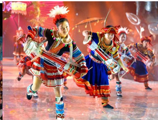
Figure 1. Macao International Parade (ICM, 2017)