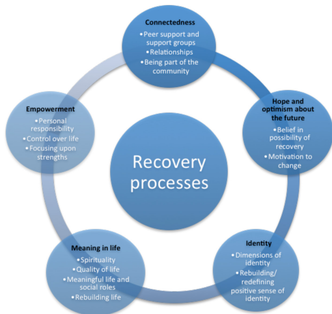
Figure 1 Connectedness, Hope and optimism about the future, Identity, Meaning in life and Empowerment recovery framework.

spanned until 2009, and no studies focused on children or adolescents were identified.