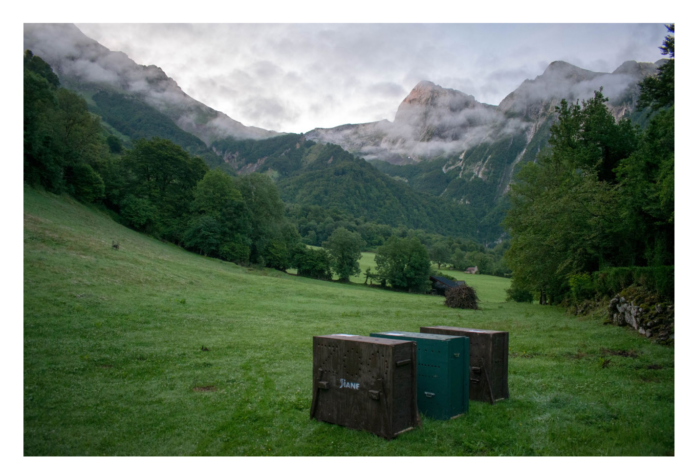
FIGURE 1 Iberian ibex in zoological transport boxes near the town of Accous in the Vallée d'Aspe, Parc National des Pyrénées, France

In the Vallée d'Aspe one dawn in August 2019, morning was slowly bringing warmth to the French Pyrenees and rays of sunlight were finding their way into the depths of the valley. A crowd of people had gathered; they waited, mostly silent, with a subtle yet palpable buzz of excitement punctuating the air. Three zoological transport boxes were grouped together in the clearing (Figure 1). Inside them were Iberian ibex, which had been brought overnight from the Sierra de Guadamarra, not far from Madrid. They weren't bucardo – they weren't the endemic animal to the Pyrenees but a different subspecies – yet there are very few people who'd be able to readily distinguish them by sight alone. Their horns were faintly smaller, they were less thickset: the morphologies of ibex accustomed to warmer climatic conditions. As the crowd of attentive bystanders waited, an ecologist invited the crowd to envision a Pyrenees populated once more with ibex. For the restoration project, it didn't matter where these ibex were from, rather where they were going. From the valley's vantage point, silhouettes appeared on the horizon,