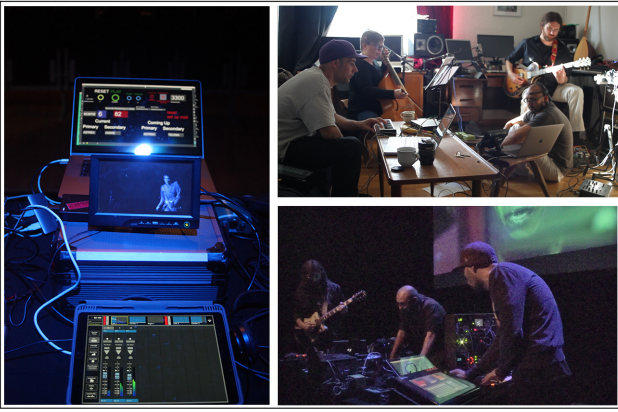
Figure 3: Left: The Intermediary Conductor’s station. Top right: Rehearsals in Reykjavík. Bottom right: Performance at Lakeside Arts, Nottingham.

then chosen to select individuals to wear the BCI headset and control the interactive film for back-to-back screenings. This double bill format not only produced 48 minutes of film content for the performers to accompany, it was also intended to embed comparison within the experience, encouraging the audience to identify differences between the screenings and appreciate the musical variety.