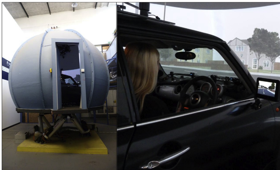
Fig. 1. The NITES high-fidelity driving simulator which comprises of a full BMW mini, housed within a projection dome and mounted on a six-degree of freedom motion base.

Fifteen participants completed the on-road and simulator drives. The on-road part of the experiment was carried out in dry, clear conditions in order to keep the on-road and simulator scenarios as similar