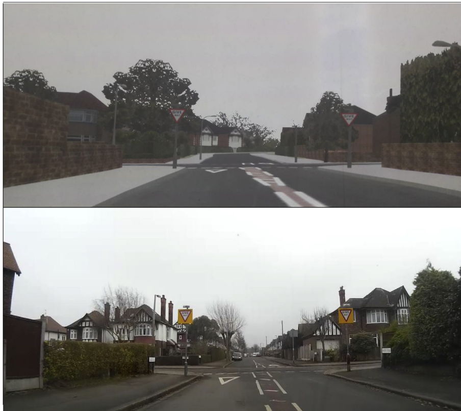
Fig. 2. An example of a driver's view ahead when approaching the same medium demand junction in both the high-fidelity driving simulator (top panel) and on the real Nottingham road (bottom panel).

was possible. The experiment did not take place during rush hour therefore did not take place between 7am and 9am and 4pm–6pm, in order to promote continuous driving behaviour.