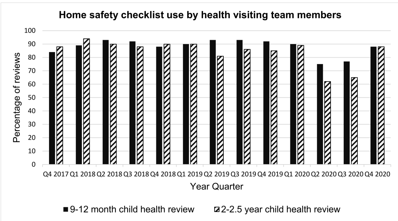
Figure 2 Electronic medical record data of self-reported SOSA home safety checklist use at child health reviews by health visiting team members. SOSA, Stay One Step Ahead.

were used with variable frequency: 72% consistently used a one-page height chart developed by Royal Society for the Prevention of Accidents (RoSPA), whereas 25% reported regularly using RoSPA's 'Keep Me Safe at Home booklet'.