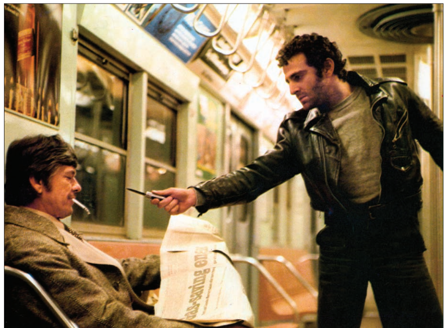
Death Wish (1974). Directed by Michael Winner. Shown: Charles Bronson (as Paul Kersey).