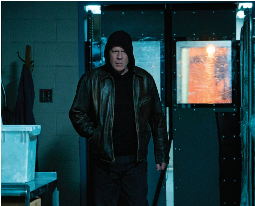
Death Wish (2018). Directed by Eli Roth. Shown: Bruce Willis.