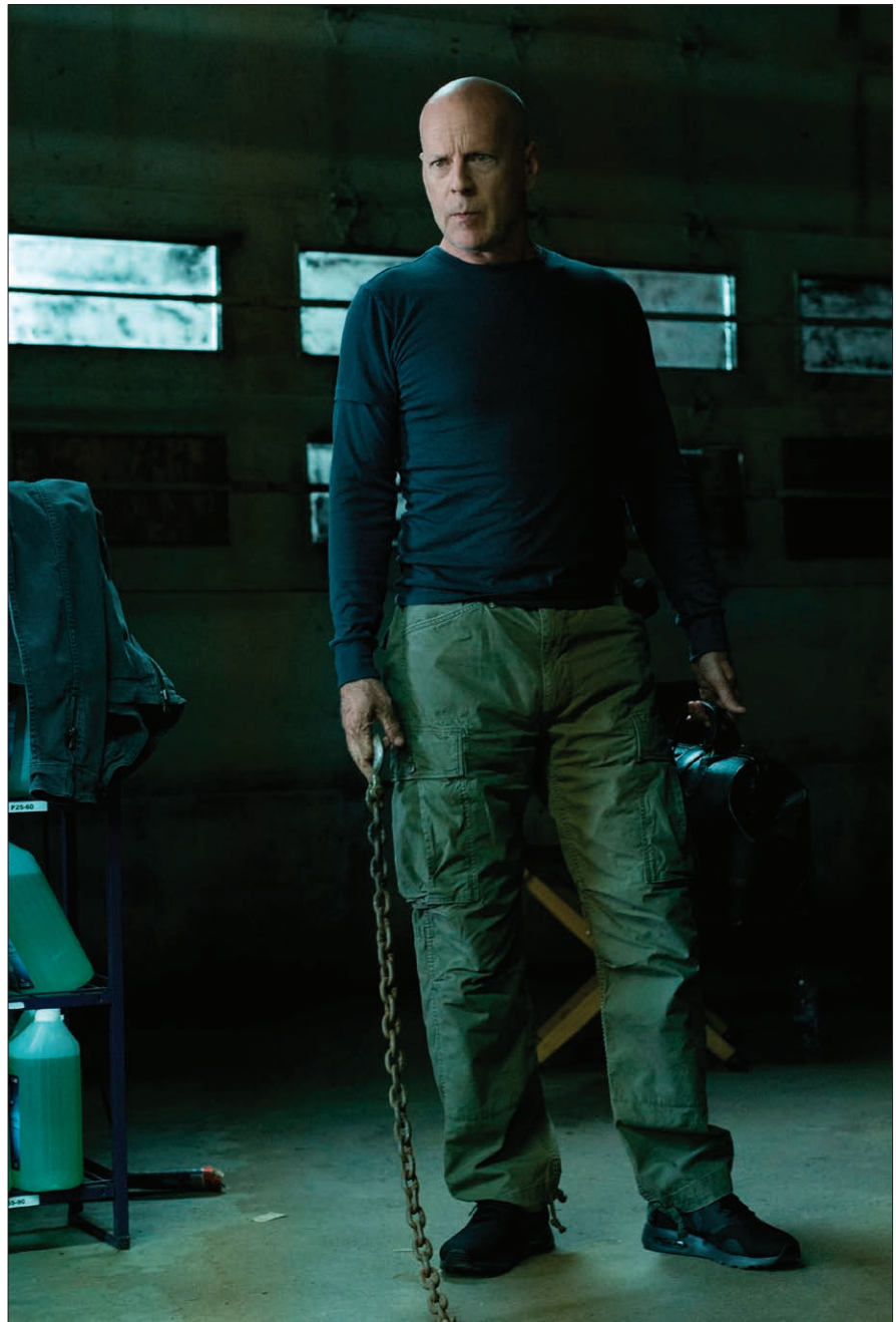
Death Wish (2018). Directed by Eli Roth. Shown: Bruce Willis.

vigilante genre as a whole is thriving, but in the guise of the superhero film. Presenting the defeat of mortal threats to humanity and the resolution of social and environmental catastrophes as contingent on the benign intervention of (super)heroic individuals, these films have become the more family-friendly, acceptable face of the vigilante movie: more cooperative ( The Avengers [Joss Whedon 2012]), increasingly inclu-