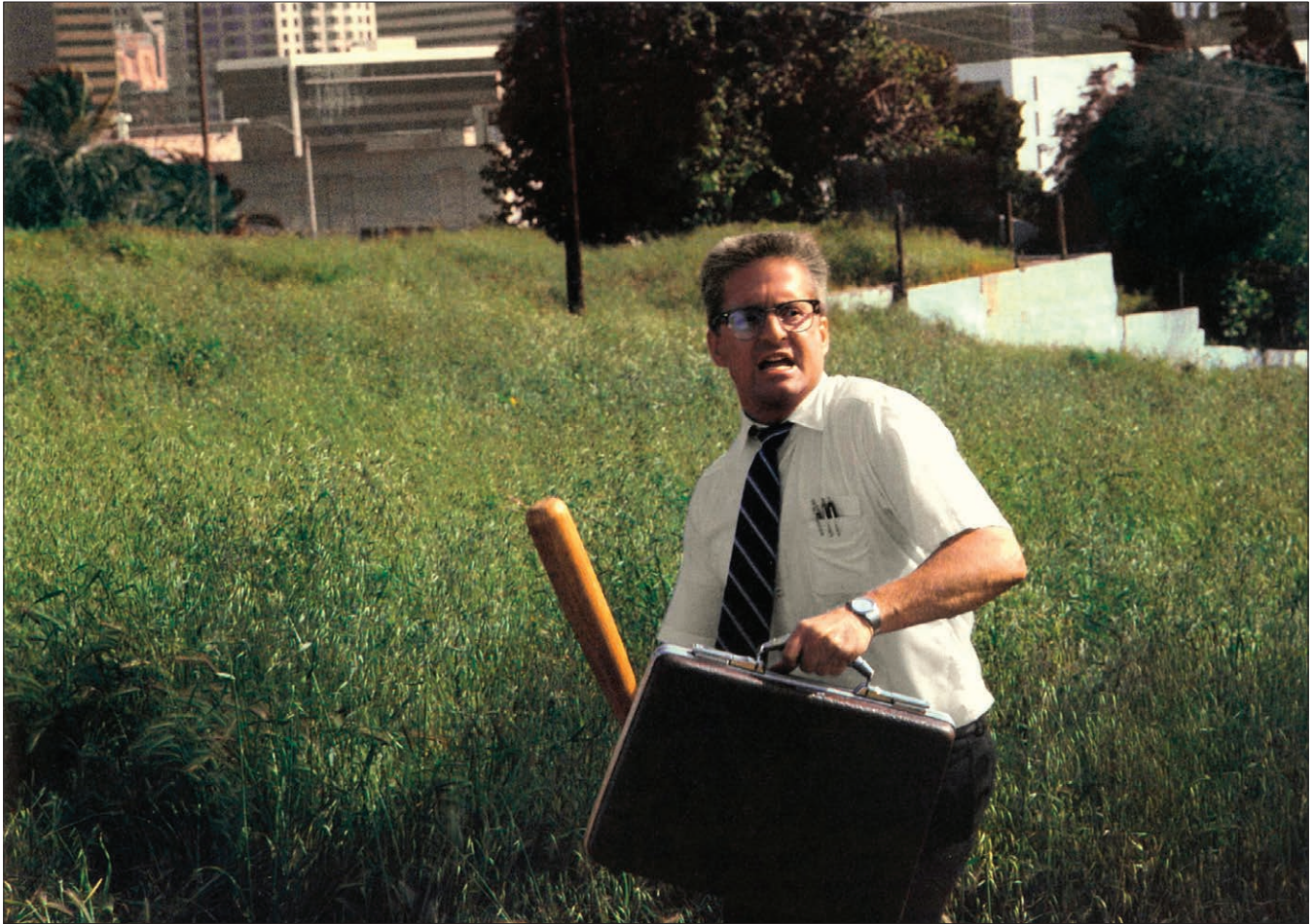
Falling Down (1993). Directed by Joel Schumacher. Shown: Michael Douglas.