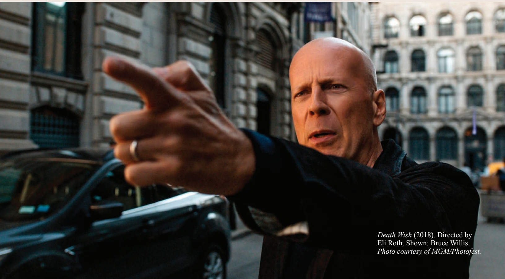
Death Wish (2018). Directed by Eli Roth. Shown: Bruce Willis.

Keywords: “aggrieved entitlement,” Death Wish , geriaction, masculinity, Donald Trump, Bruce Willis, vigilante