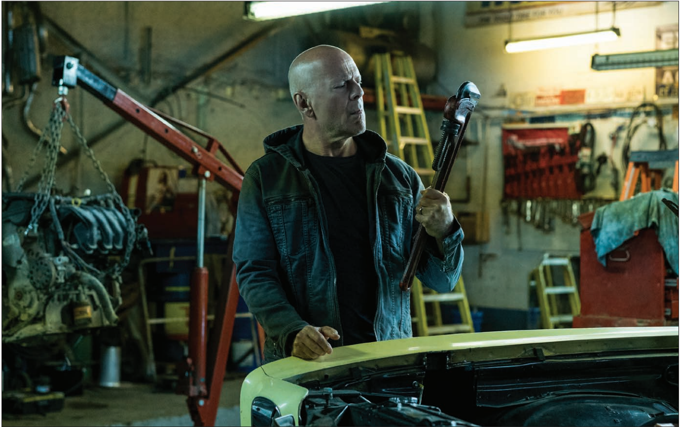
Death Wish (2018). Directed by Eli Roth. Shown: Bruce Willis.

The contemporary vigilante film prescribes a very similar solution to the problems facing the United States, looking to harness the rage of the emotionally wounded white male to return the nation to stability. As sociologist Michael Kimmel suggests, men in the contemporary moment feel a sense of “aggrieved entitlement,” a state of permanent dysfunction whereby they resist an inevitable future of racial and gender equality ( Angry White Men 18). The structure and style of these films construct older white men as besieged victims, “protecting white women and the traditional family from rapacious sexual predators and protecting a distinctly American vision of masculinity—the Self-Made Man” (Kimmel, Manhood in America 254). It is these men who formed the base of Trump’s support during his run for the presidency in 2016: middle-class, Republican white men who feel “disenfranchised” and “cut out of the American Dream” (Thompson). The rhetoric Trump employed through his campaign and during his presidency appeals directly to the fears and con-