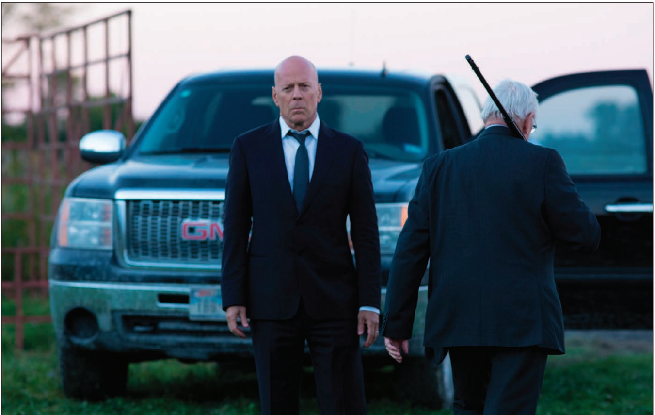
Death Wish (2018). Directed by Eli Roth. Shown: Bruce Willis.

Kersey’s actions also receive official institutional approval. When he exterminates the last of his family’s assailants, Detective Raines (Dean Norris), the police officer who has been working to solve Kersey’s wife’s murder and pursued him as the mysterious vigilante, accepts Kersey’s version of events even though it is obvious he is lying. In his rebellion against healthy eating and casual disregard for the well-being of Chicago’s homeless (saying Kersey could “run them over” with his