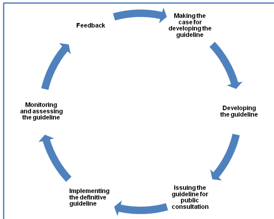
Figure 3. Guideline development process

(Figure 3) was used in the discussions, which includes: making the case for developing the guideline, developing the guideline, issuing the guideline for public consultation, implementing the definitive guideline, monitoring and assessing the guideline, and feedback. This has since been updated (see Figure 1).