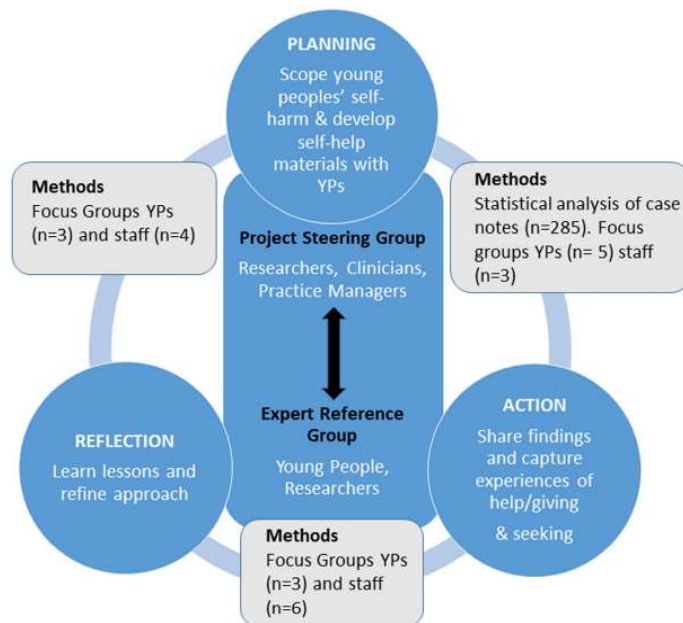
Figure 1: Participatory Action Research Approach