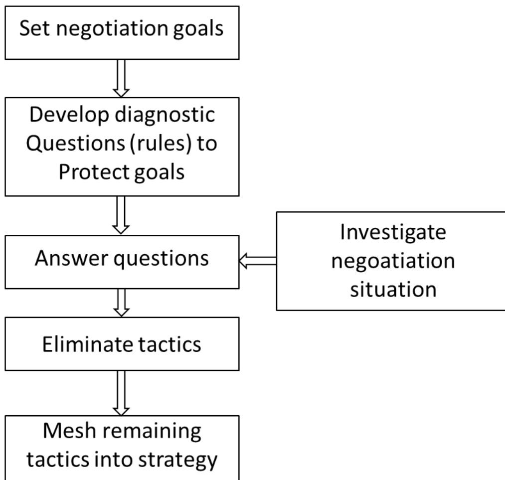
Figure 3: Development of a negotiation strategy, taken from Wall Jr (1985: 127)