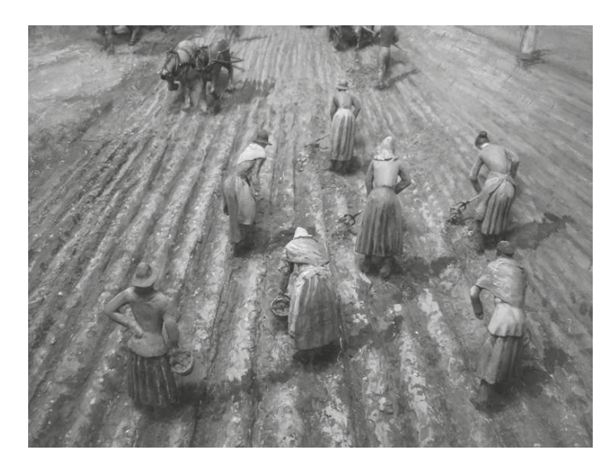
Figure 6.2 Detail of 'Manuring and Potato Planting, 1850' diorama. Source: photograph by the author, November 2015.

History was also set in progressive harness in dioramas from medieval to Victorian; medieval oxen ploughing, horse ploughing, steam ploughing, progress in technology vividly rendered. A diorama of 'Manuring and Potato Planting, 1850' (see Figure 6.2) showed women, backs bent, facing away from the viewer, hand-planting in a just-ploughed and manured field, a farmhouse, barn and church beyond on the painted backdrop. The full diorama label gives a precise narrative of socio-technological history, and enrols the scene into the broader narrative of gallery displays: