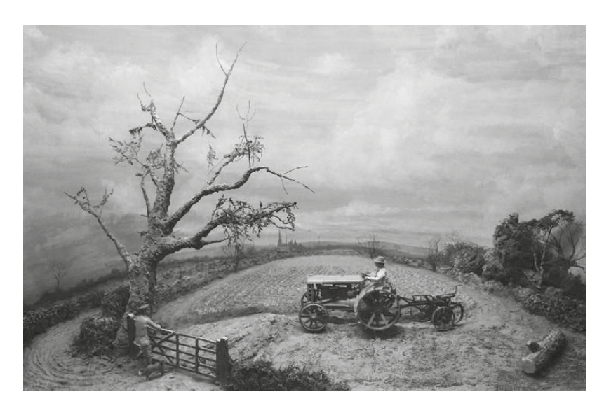
Figure 6.3 'Tractor Ploughing, 1917' diorama.

such as Paul Nash's 1918 Western Front painting 'We Are Making a New World', held in the Imperial War Museum. Nash's mordant title could lend an un-ironic label to 'Tractor Ploughing, 1917'.