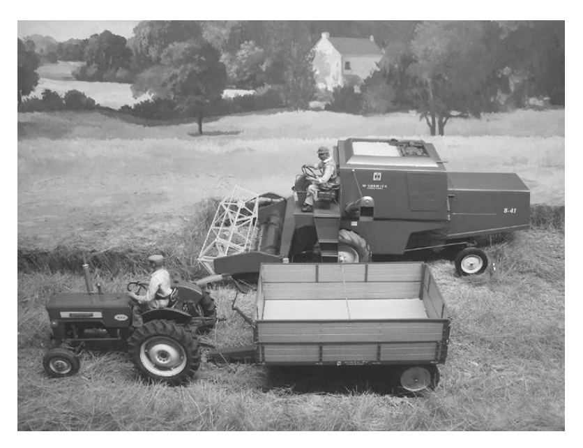
Figure 6.4 Detail of 'Summer' diorama. Source: photograph by the author, November 2015.

(ploughing, cultivating, harrowing, rolling), grooves and dust made and overridden in movement, into a tunnel and out again: